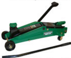
SUV Jack with Foot Pump